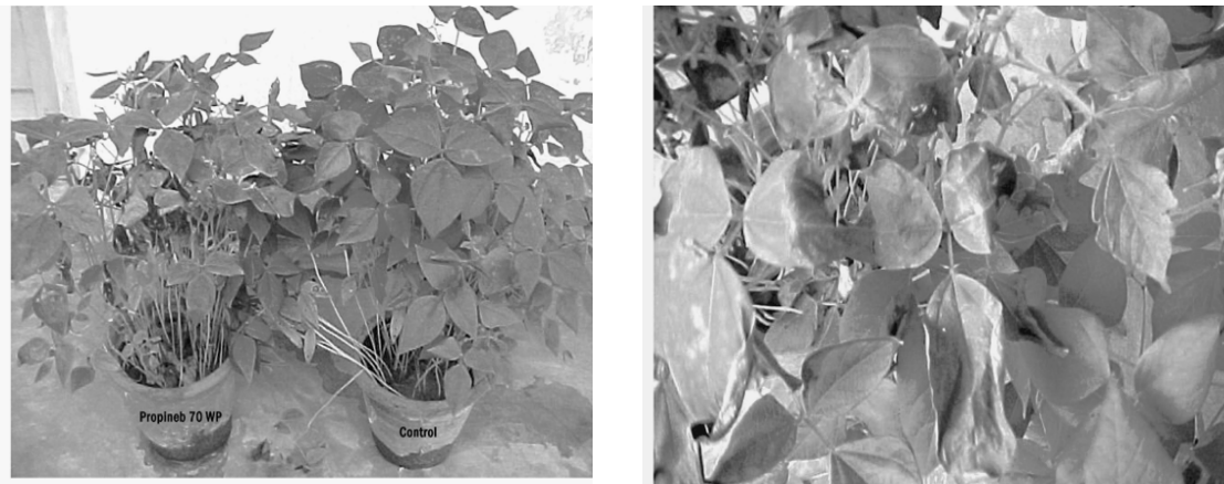
Plate 1: Phytotoxicity of propineb 70 WP on mungbean